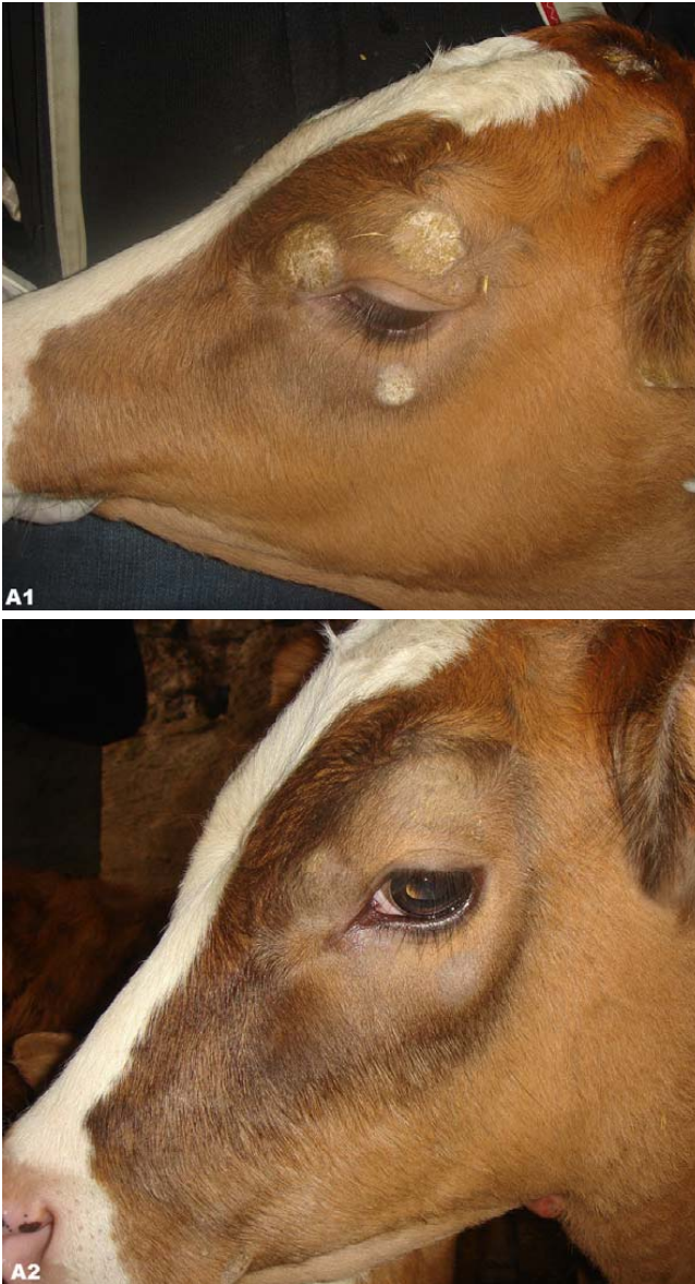
Fig 1. Calves with dermatophytosis in Group I, (A1) before treatment with ivermectin, (A2) recovery after treatment

Şekil 1. (A1) İvermektin ile tedavi edilmeden önce Grup I'deki buzağı resmi, (A2) tedavi sonrası iyileşme