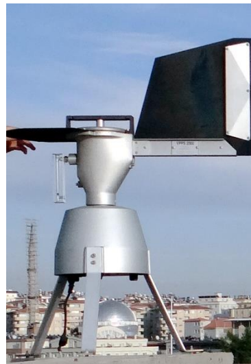
Figure 1. Hirst-type pollen and spore trap (Lanzoni VPSS 2000)

Materials were collected by using Hirst-type pollen and spore trap (Lanzoni VPSS 2000, Bologna, Italy), placed 25 mm above ground level in the city center in 2005 (Figure 1). The device absorbs 10 L of air per minute equivalent to the human lung (Sánchez Reyes et al., 2016). The air sucked through the 2×14 mm wide hole, then enters the spore trap. The hand-held sampling cylinder with a mechanical watch on it travels 2 mm per hour to 48 mm per day and completes its full cycle in one week. 336 mm transparent tape is applied around the sampling cylinder and silicone oil solution is applied on it. The air entering the spore trap strikes the transparent tape on which adhesive is applied and the contents adhere to the tape. The band which is taken from the cylinder after completing its cycle is cut on the cutting board and then turned into daily preparations. Sampling and analysis were performed according to the guidelines of the European Association of Aerobiology (Galán et al., 2014). The number of fungal spores was multiplied by the calculated conversion factor and the average daily spore concentration in the cubic meter was determined (spore/m 3 ). Fungi detected in the atmosphere above 5% were accepted as common elements of the atmosphere (Mallo et al., 2011). Fungus spore calendar was prepared according to Spiessma (1991).