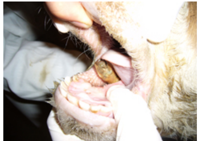
Fig 1. Bilateral open fracture in the corpus mandibula (necrosis)

margo interalveolaris were formed in bilateral as an oblique open fracture. One of these was not treated since it was brought to the clinic after three weeks of parturition and the necrosis was seen in mandible ( Figure 1 ). Another case was not evaluated in terms of treatment and results. The remained 8 cases were