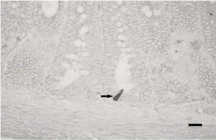
Şekil 3: Duodenum mukozasında somatostatin-immunoreaktif hücreler. ABC. Bar: 50 µm