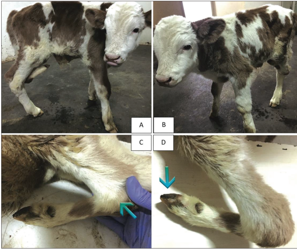
Fig 1. A, B: View of the patient from right and left side with the animal standing; The animal can easily stand and walk on three limbs; C: Excessive flexural deformity and appearance of torsioned joint (arrow). The front face of the limb is at the back and the front of the back is at the distal part of the distal part of the tarsal joint (there is approximately 180° rotation); D: In the rotated limb, the solea part of the 3 rd phalanx was located dorsally (arrow)