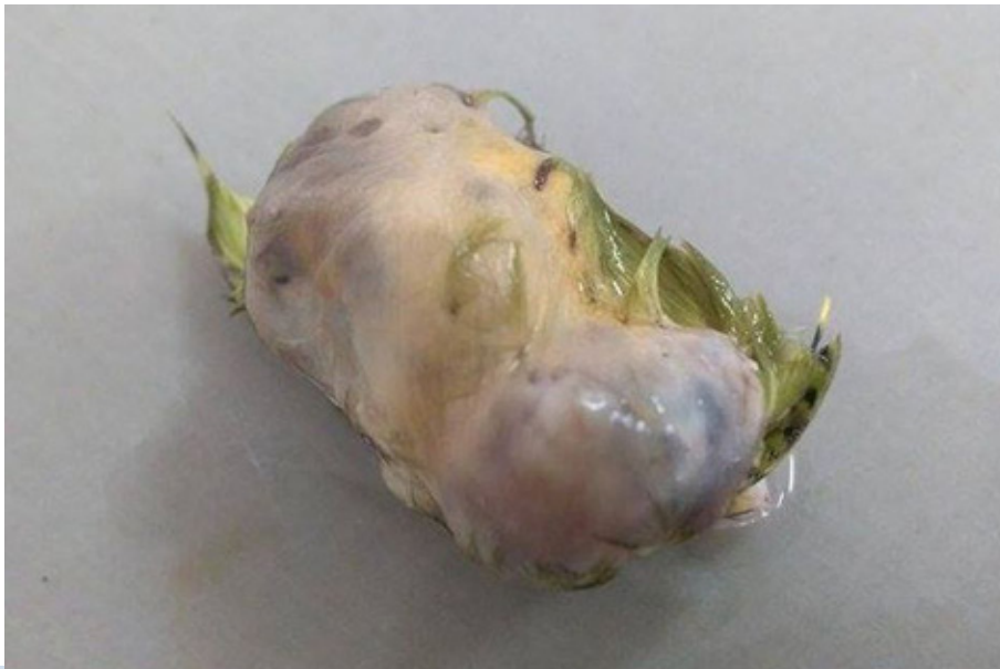
Figure 1. A nodular subcutaneous mass in the budgerigar

In microscopic view, pleomorphic mostly round to oval shaped cells having round to oval nucleus with dense chromatin at nuclear periphery were observed (Figure 2). The cells were mostly haphazardly located. Spindle shaped fibroblastoid cells trying to form weak bundles and few inflammatory cells were recognizable within the tumor mass, which had